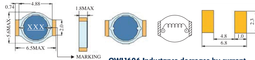
OWI1606 Inductance decrease by current